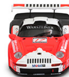
RS 0092 Triple pack edition 1997