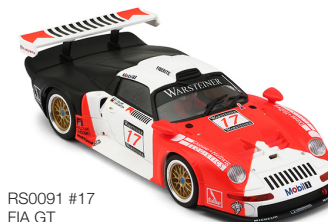
RS0091 #17 FIA GT Nurburging 1997