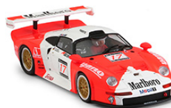
WHITE KIT RS 0065