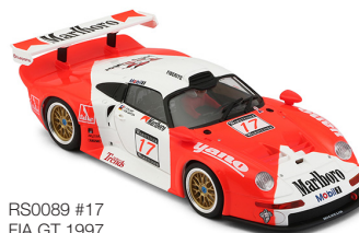
RS0089 #17 FIA GT 1997