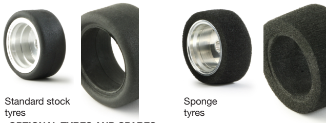
Standard stock tyres